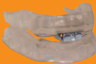
Sleepwell™ Tailor Made for you

Sleepwell™ is a life changing treatment to stop snoring